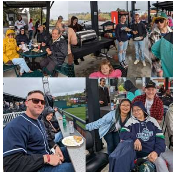
We had 4 Post Officers and 2 Auxiliary Officers attend the event along with 4 Auxiliary members, 10 non-member supporters, 2 VFW members from Federal Way Post, 5 from Scout Troop 419 families. I want to thank each of you who came along to help host this event with our Adopted units. They enjoy meeting and getting to know us as much as we enjoy spending time with all of them.