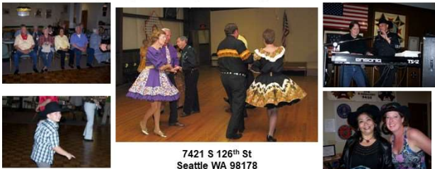
7421 S 126 th St Seattle WA 98178

WEAR YOUR WESTERN PARTY OUTFITS PRIZES FOR BEST WESTERN ATTIRE