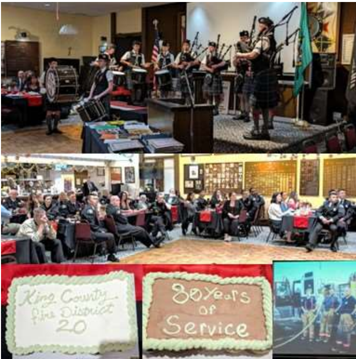
The bag pipers were amazing and put on a great show. The food fantastic as always and what a great video of the 80 years of Fire District 20!