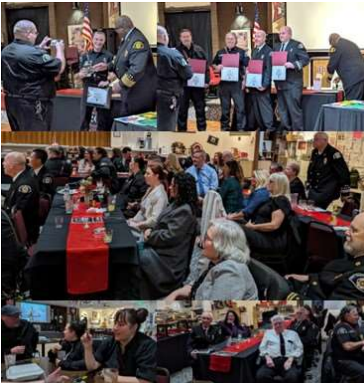
Congratulations to the Firefighter of the year and to all the Service Award recipients at this years King County Fire District 20 Annual Awards Banquet.