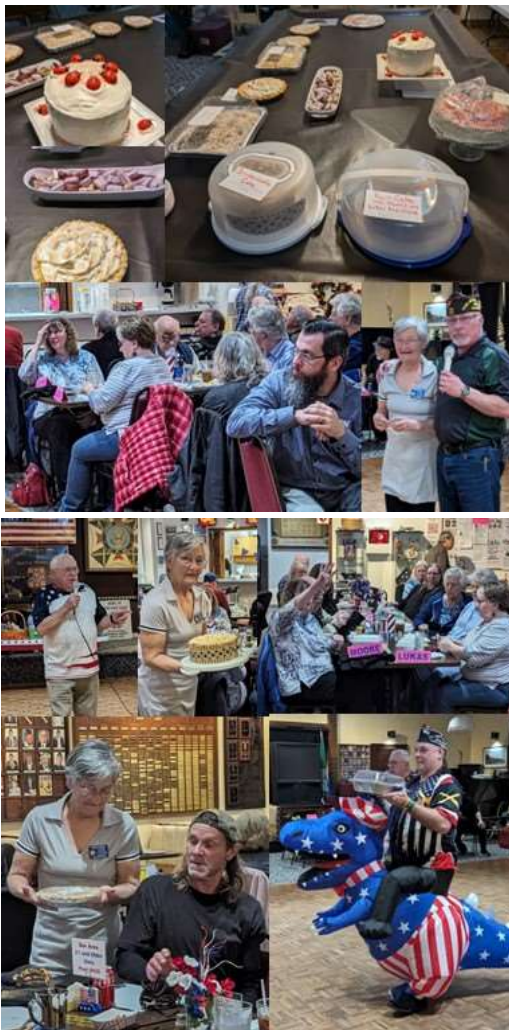
VFW Auxiliary 9430 held a basket raffle and dessert auction during the event. It was great to see so many Department Line officers from the VFW and Auxiliary as well as Past Officers and Presidents to support the future State President.