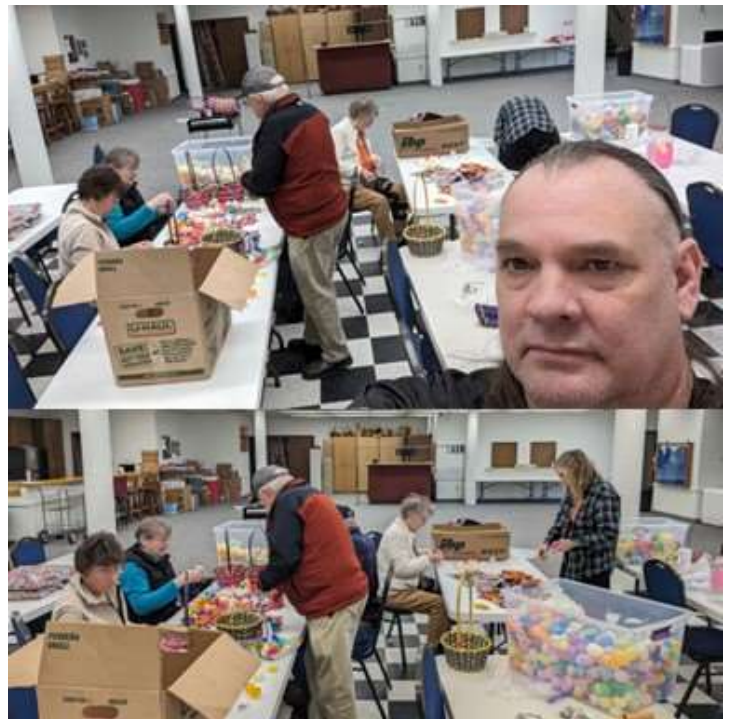
Thank you to the group that came and stuffed over 1200 Easter Eggs for the annual Easter Egg Party. We were a small group but accomplished much and had fun together doing it