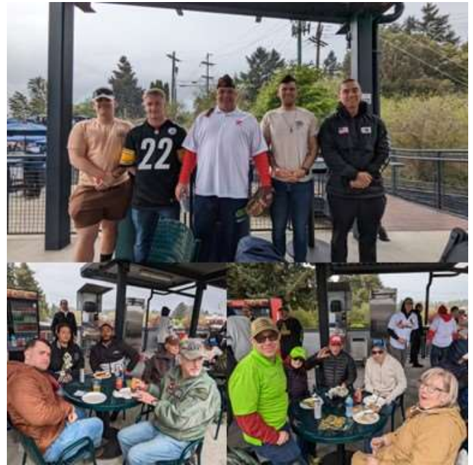
Thank you to all the Post and Auxiliary members that came out helped host Soldiers and Family members from our Adopted units at JBLM