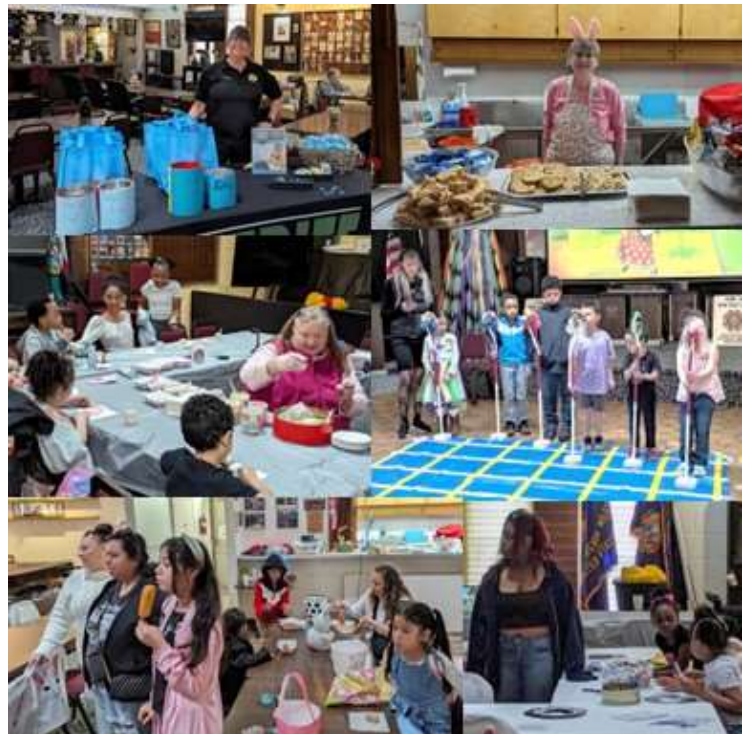
Basket Raffles, Yummy Snacks, Cookie Decorating, Horse Races, Eating Corndogs and waiting a turn for the Races and Arts and Crafts. So much to do while waiting for the Easter Bunny to arrive!