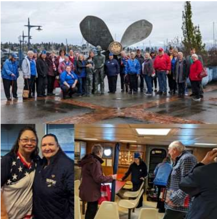
After greeting the National President, we moved to the USS Turner Joy for a tour of the ship and lunch aboard. It was tight quarters for lunch, but we enjoyed the company and the tour. Some even found an item or two in the gift shop.