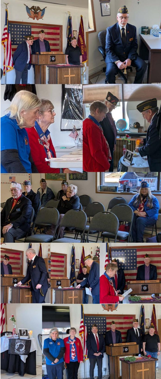
Honoring the fallen Comrades, Brothers and Sisters we lost this past year in VFW Dept of WA District 11 Posts and Auxiliaries