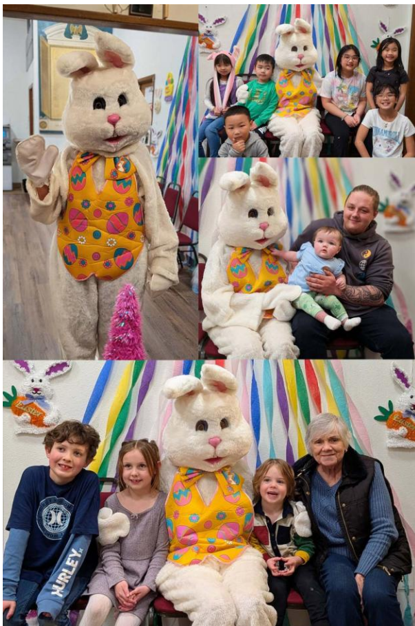
Thanks Easter Bunny!!