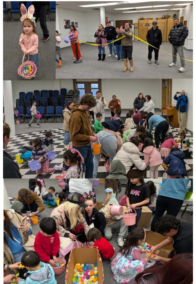
Thank you egg filling, egg hiding, egg event crew for making this happen for these kids-way more pictures on facebook!