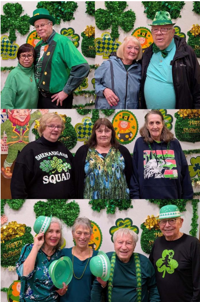
As always, selfie station pictures are fun and entertaining! Great memories made here!