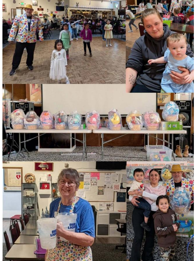
Food-Drink-Dancing-Hula hooping-basket raffle-Arts and Crafts-Hot Dogs and Chips-and lots and lots of kids!