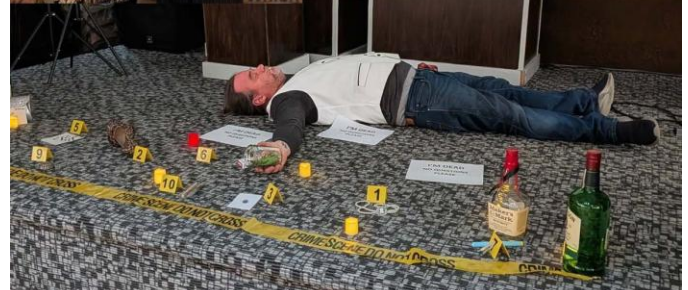
Great fundraiser for our Department Sr Vice Commander and President. Thanks to all who helped put this together and to all who dressed the part and played along in the 1920s setting! Everyone want to know..... Who done it??????