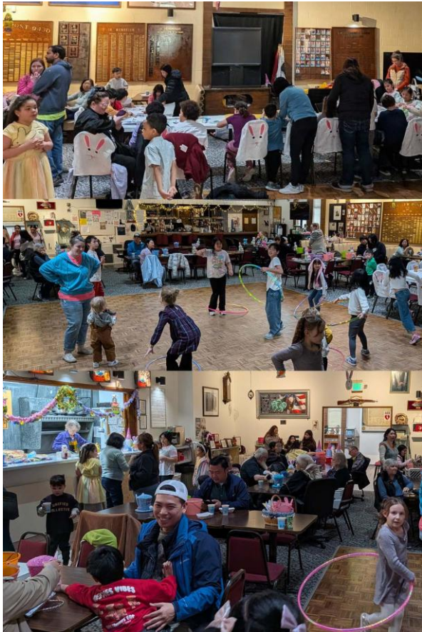
Shout out to everyone behind the scenes making all these great activities happen for these families! Smiles EVERYWHERE!